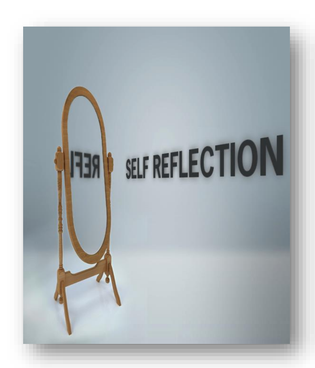
Being aware and conscious of one's own world view