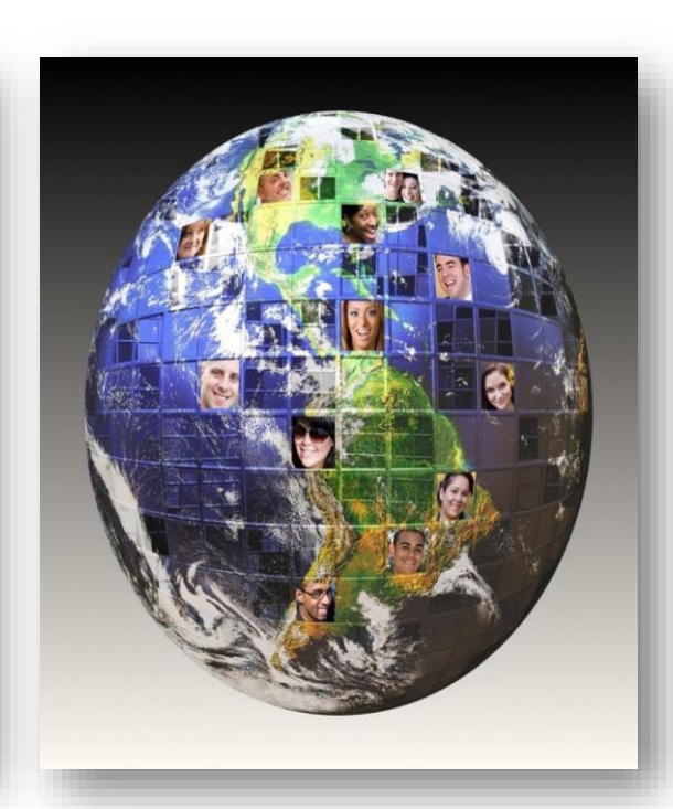
Gaining knowledge of different cultural practices and world views