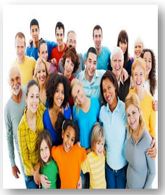
Developing positive attitudes towards cultural differences